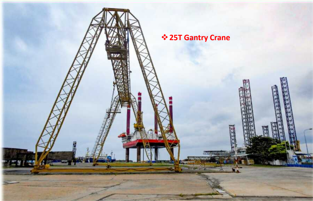
❖ 25T Gantry Crane