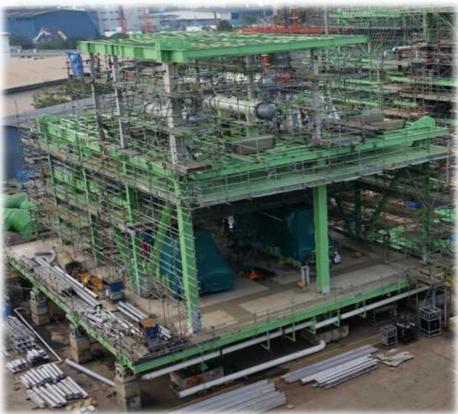
FPSO BW Catcher (M60)