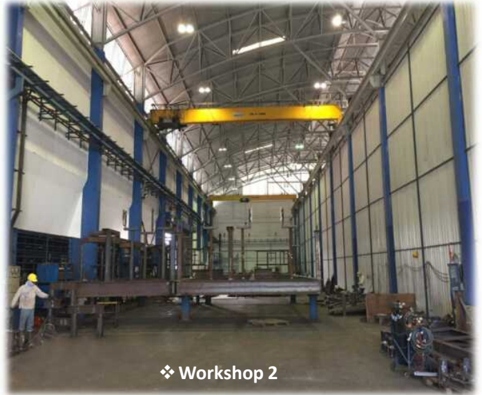
❖ Workshop 2