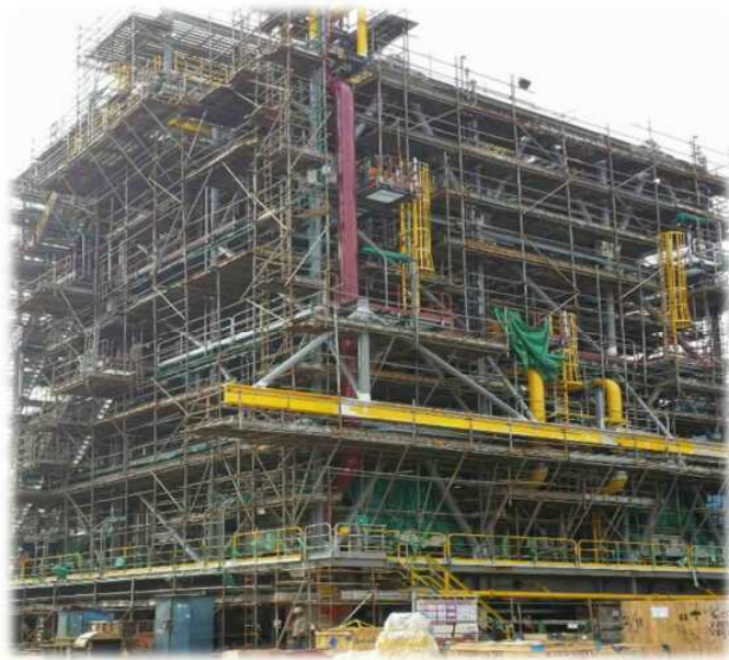
FPSO Cidade de Maricá