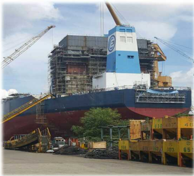
FPSO Kaombo Norte