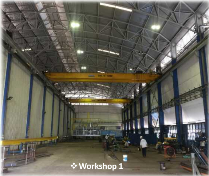
❖ Workshop 1